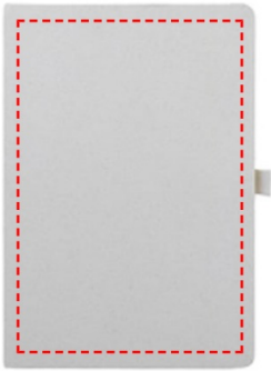
FRONT NOTEBOOK LARGE